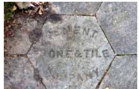
Read about our vexing historic sidewalks in next month's Messenger .