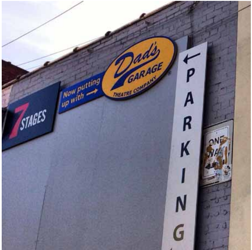
Dad's Garage is temporarily parked at 7 Stages.