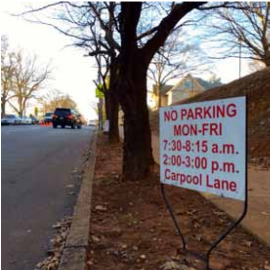
Candler Park Drive.

The first change announced was the removal of the northbound drop-off point on Candler Park Drive. Some feared this would cause a ripple ef- fect to neighborhood traffic patterns, though it seems to be working reason- ably well so far. A November 21 email blast from the school said, “With the closing of the back parking lot, we need as many parking places as pos- sible, hence, the decision to eliminate the morning parent carpool drop-off in the morning.” A blog post by the principal several days later stated, “The ultimate goal is to have a safe and orderly procedure in place for students to arrive at school.”