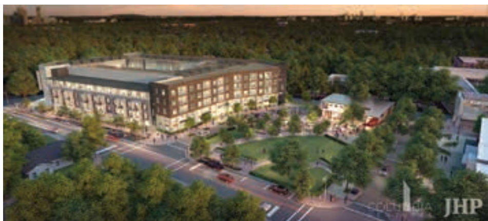
MARTA plans to turn a mostly empty parking lot into an urban wonderland.