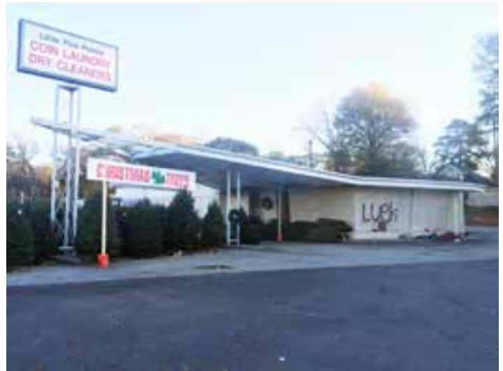
Chipotle looks to clean up this spot on Moreland.