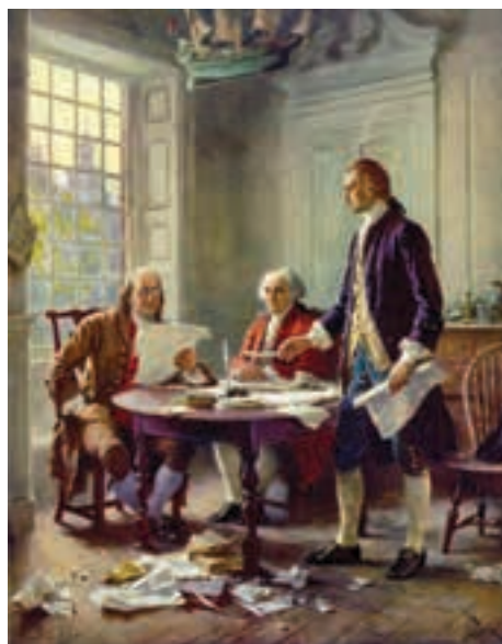
Candler Park Bylaws Review Committee hard at work revising our governing documents at a recent meeting.

1. Collect input: We've published a survey at candlerpark.org/bylawsupdate and let members know about it through announcements at the Members Meeting, publishing it in the Messenger and candlerpark.org , and broadcasting it via e-mail blasts. We've also proactively e-mailed key participants, including past