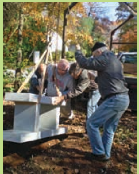
Neighbors install bench at site of first Antioch East Baptist sanctuary on Oakdale Road, Photo: Edith Kelman

Speaking of which, CPNO is happy to welcome March's new members: