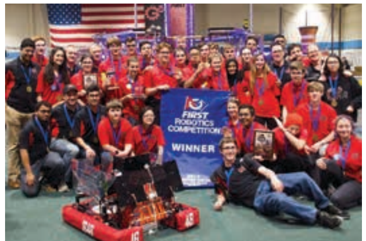
G3, Grady's winning robotics team.