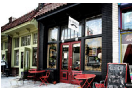
Above: Dr. Bombay's