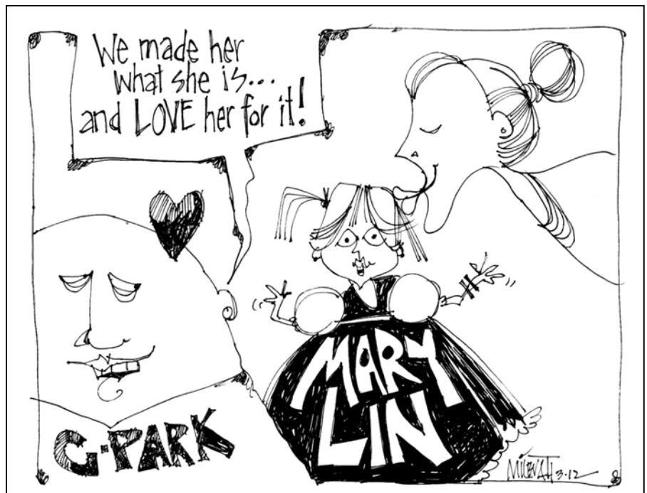
Laughter in the Park