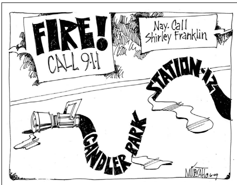
Laughter in the Park

So, Candler Parkers, I encourage you to enjoy the summertime by proudly hanging your panties on the line and spending the money you save on something yummy, like ice cream or cold beer.