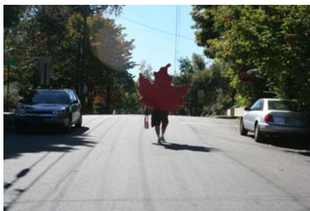
Who knows? Maybe the mysterious Leaf Monster, spotted recently on Page Avenue, will show up at Fall Fest!

For more information including the complete entertainment lineup, visit www.fallfest.candlerpark.org .