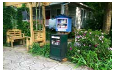
McLendon Ave. Little Free Library.