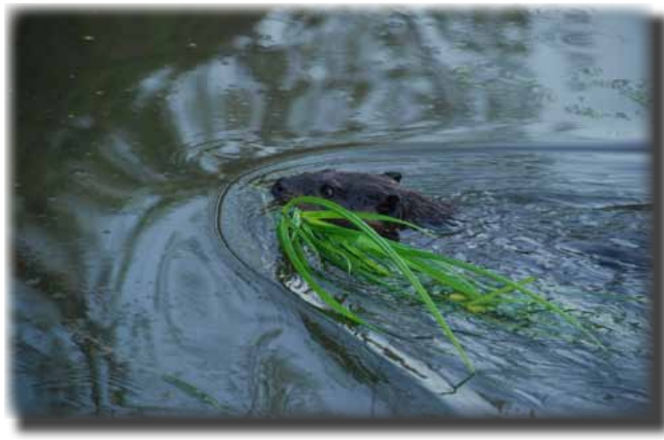
Beaver with foliage.