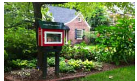
Page Ave. Little Free Library.

Littrefreelibrary.org has an interactive map showing all of the registered Little Free Libraries. The map includes addresses, contact information, and photos. Check it out and then check out some books in Candler Park or wherever your travels take you.