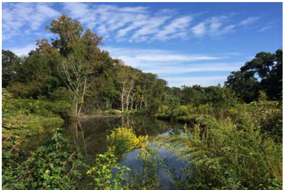
Candler Park Golf Course beaver pond.