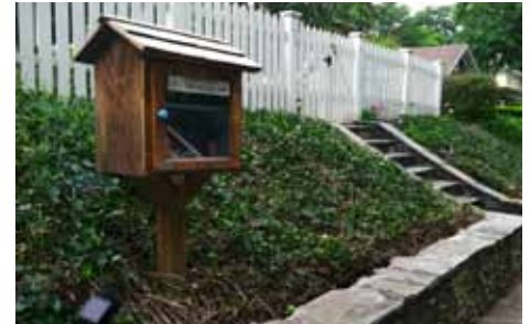
Elmira Place Little Free Library.

Free Libraries.” And, he wrote, “I also wanted to increase my own sense of community and feel more in touch with my neighbors.”