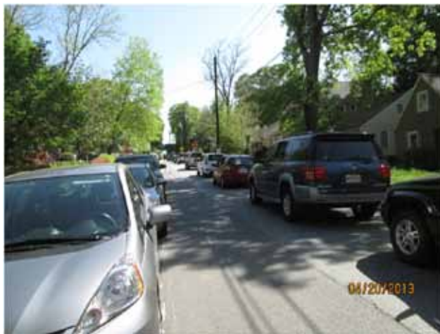
Parking during the 2013 Sweetwater 420 Festival.

Read the survey summary on the CPNO website at www.candlerpark.org/files/festival-survey-results.pdf