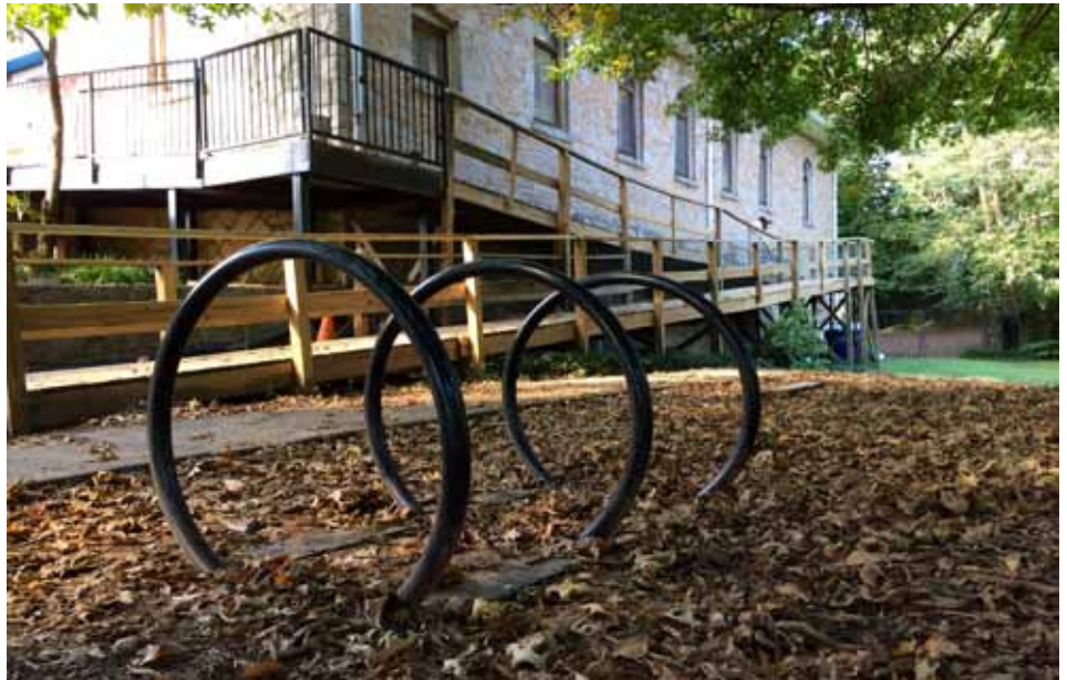
New bike racks at the First Existentialist Church.