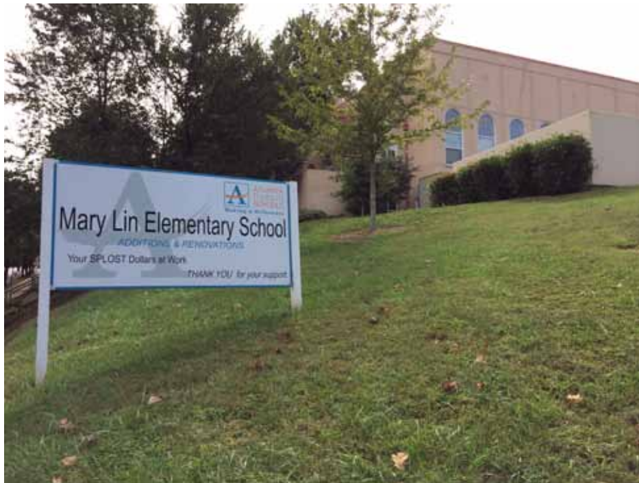
Mary Lin Elementary School.

Subcontractors will not be allowed to park on campus or park on the neigh-