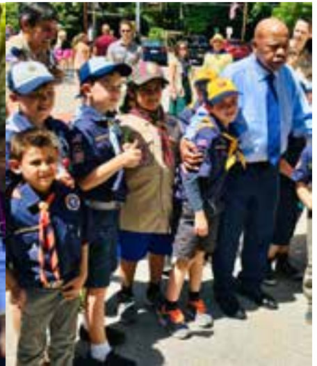
▲ Congressman Lewis with Cub Scouts Pack 586.