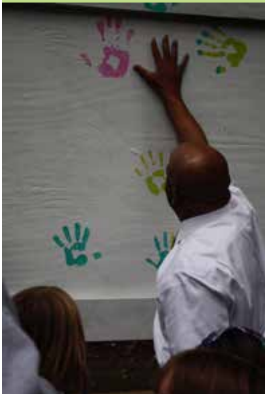
▲ Congressman Lewis leaves his handprint on the board in the outdoor classroom.