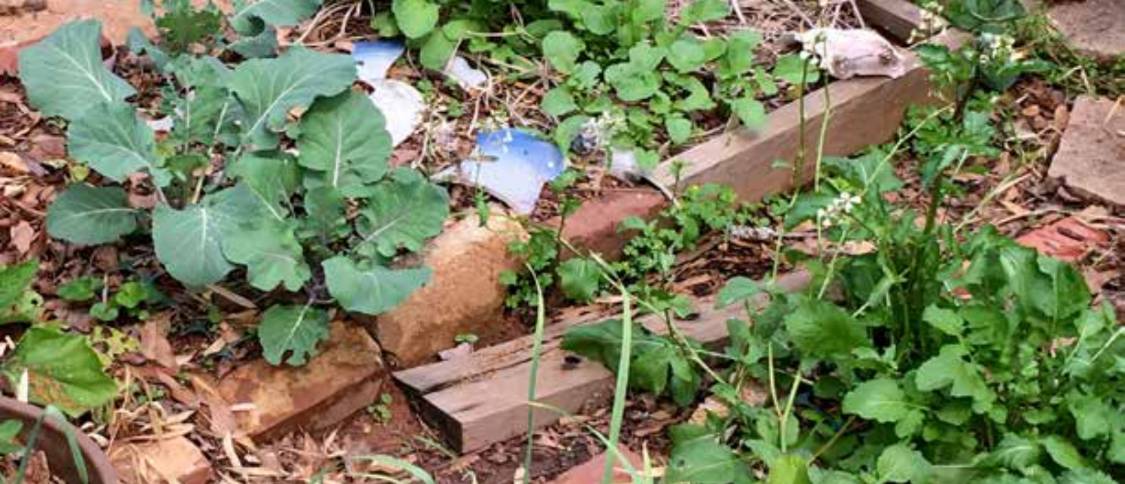
Collards, radishes, and arugula are off to a great start in a cleared out fall garden bed