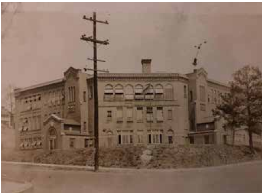
Undated photo of the Howard School from many years ago.