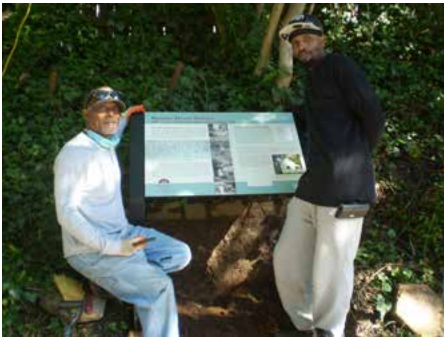
▲ Warner Construction Inc., father-son team installed the Hooper St. Legacy Marker with care and generosity.