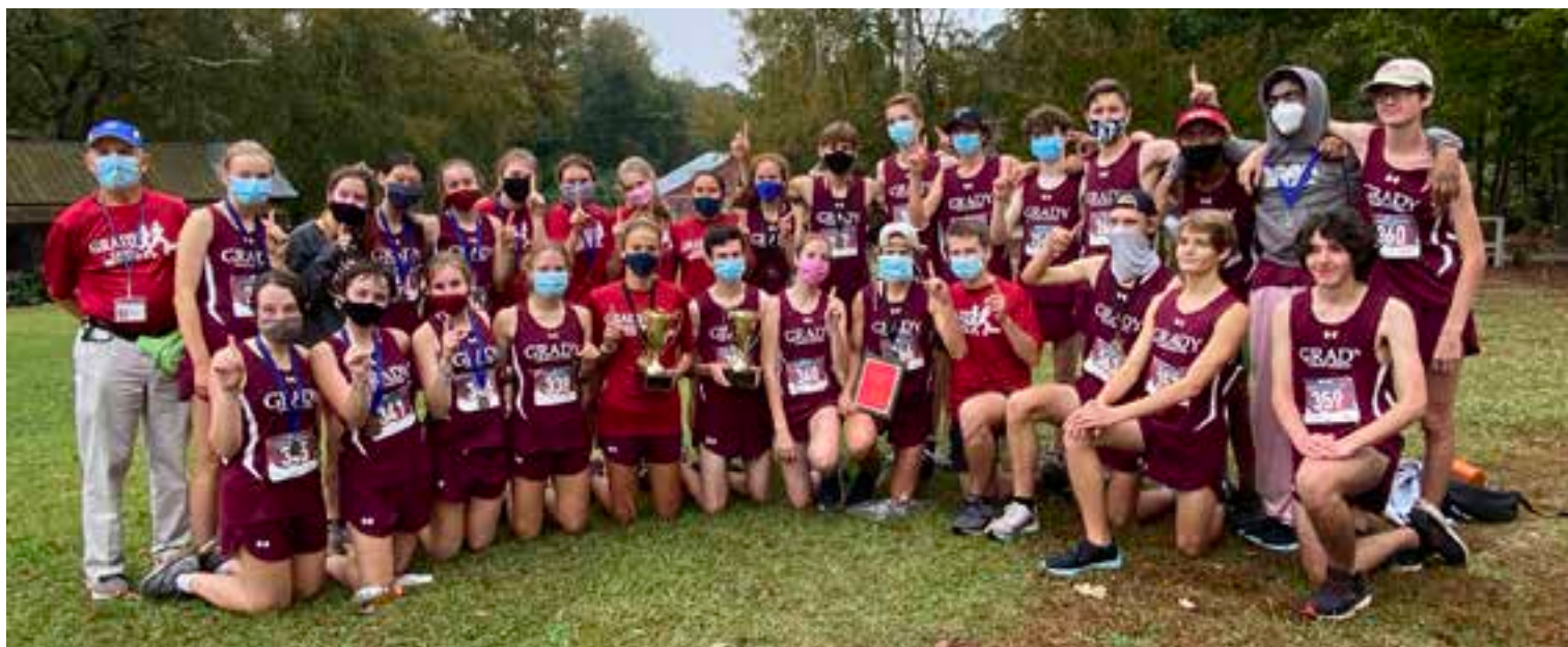
▲ The Grady High School varsity and junior varsity teams after the regional qualifying meet at Clinton Nature Preserve on September 24.