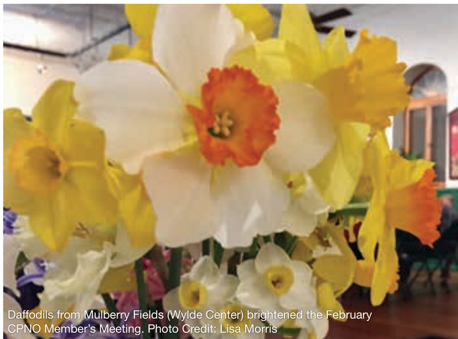
Daffodils from Mulberry Fields (Wylde Center) brightened the February CPNO Member's Meeting.

In case of cancellations or changes, check CPNO's online Events at candlerpark.org . For meetings at Epworth, knock on door at street level to get in. All CPNO meetings are open to the public.