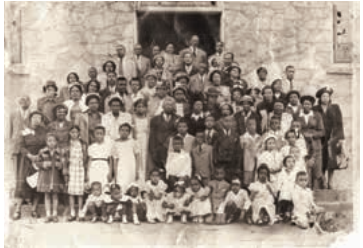
In 1948, Antioch East Baptist Church members stood proudly on the front steps of their 'Old Stone Church' here in Candler Park. Hand-built by Antioch 1918-1922, this was their second church structure built in Candler Park.

and www.atlantapreservationcenter.com and click on Phoenix Flies for event program and reservation information.