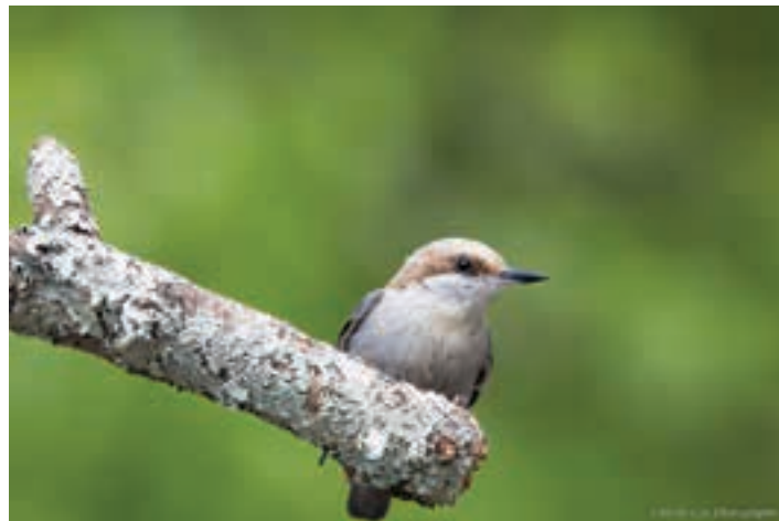
Brown-headed Nuthatch.

For more information on Atlanta Audubon Society's Brown-headed Nuthatch program, visit www.atlantaaudubon.org .