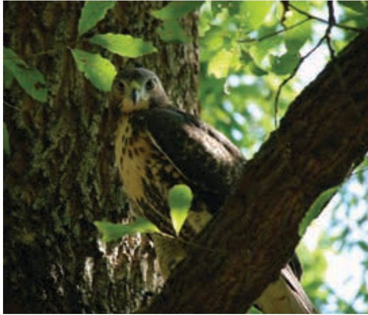
Red tailed hawk in Candler Park.

In fact, owl parents, to feed their families, may catch as many as 3,000 rodents in one season ( hungryowl.org )—and a season is only about 4 months. However, when people use rat poison, the birds who eat poisoned rodents are killed by the poison too. In Georgia, wildlife is generally not tested for cause of death, but the wildlife hospital, WildCare, in San Rafael, California, which has tested dead wildlife since 2006, report that an astonishingly high number--over 80% of wild animals--owls, hawks, foxes, and other predators -- test positive for deadly anti-coagulant rat poison ( wildcarebayarea.org ).