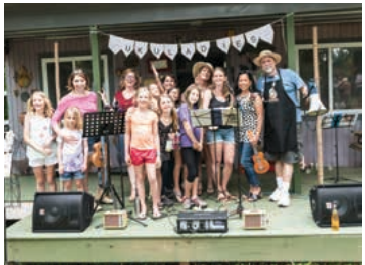
The Real Ukuladies of Atlanta were joined on stage by their daughters and friends to sing "A Million Reasons" by Lady Gaga.