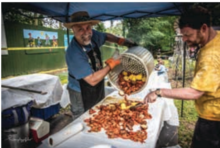
Many pounds of crawfish, corn, potatoes and sausage were enjoyed!