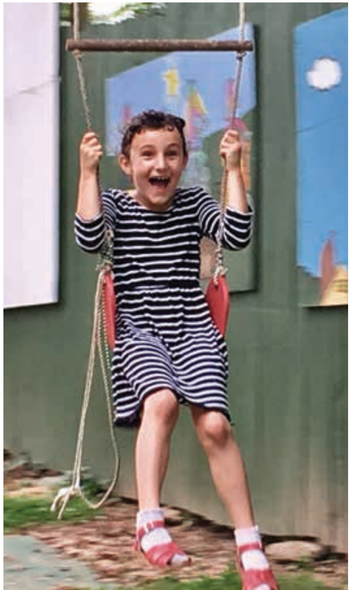
Kids enjoyed the thrill of the zipline.

Thanks to the CPNO for supporting this event!